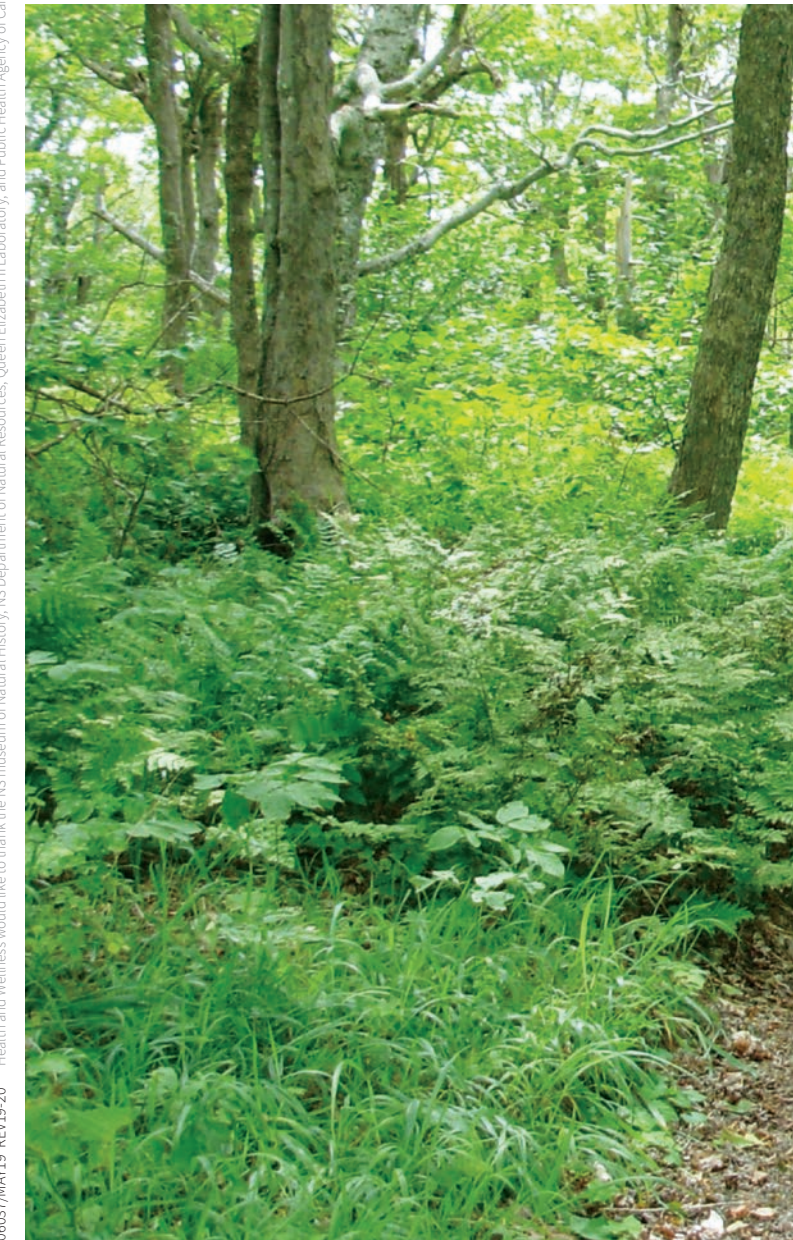
Health and Wellness would like to thank the NS Museum of Natural History, NS Department of Natural Resources, Queen Elizabeth II Laboratory, and Public Health Agency of Canada for their assistance with this pamphlet. 06037/MAY19 REV19-20