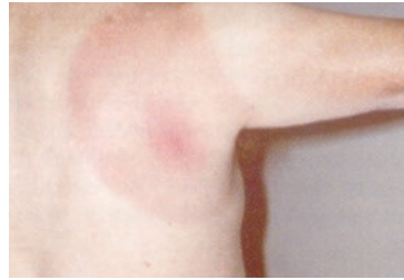
Bull's eye rash

You may also develop flu-like symptoms, such as fever, headaches, tiredness, stiff neck, pain and swelling in the joints, and aches and pains all over your body. Symptoms may appear in stages and may appear over a period of months.